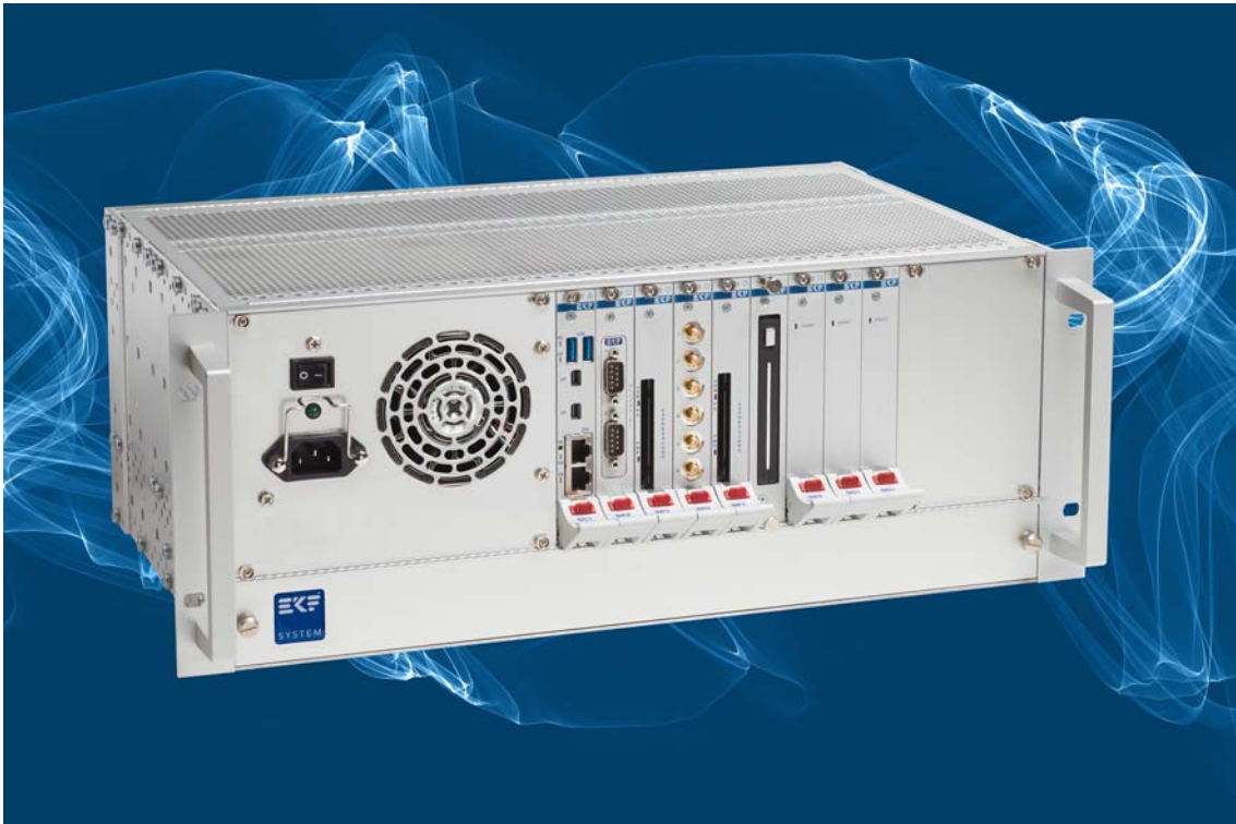
SRS-8421-SERIAL • Sample System Configuration