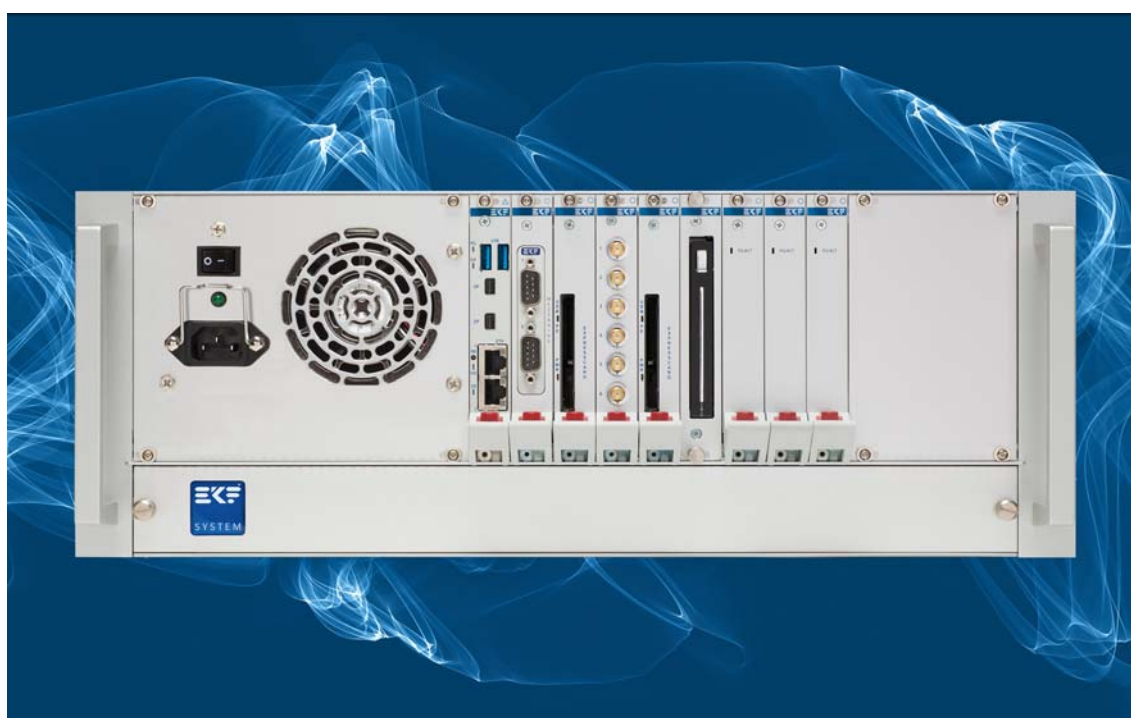
SRS-8421-SERIAL • Sample System Configuration